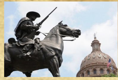
Terry's Texas Rangers Monument at the Texas Capitol.